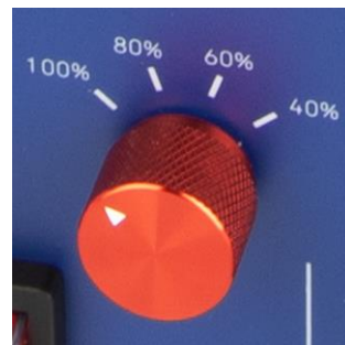
Ultrasonic power regulator: 40% / 60% / 80% / 100%