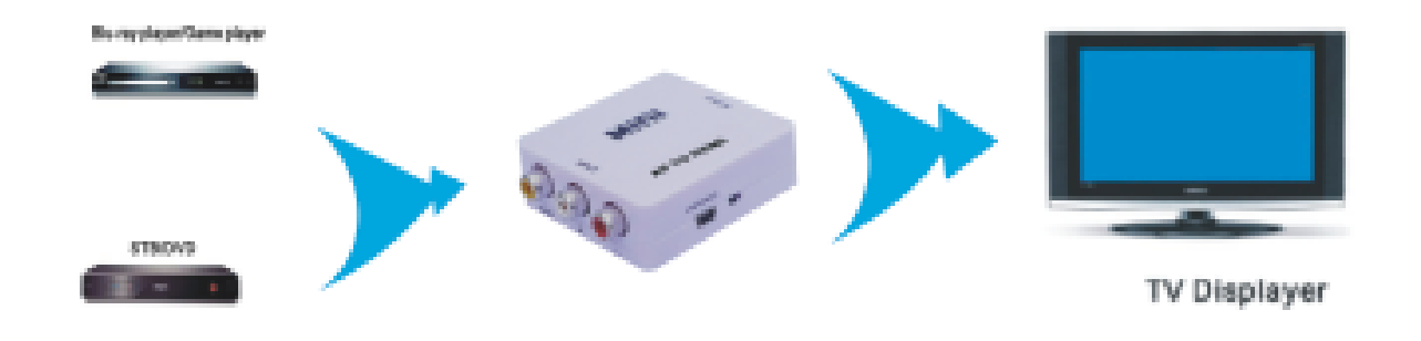
AV TO HDMI CONVERTER