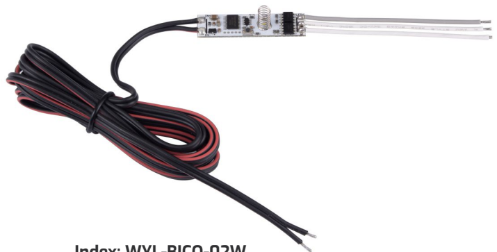
Index: WYL-BICO-02W BICO touch switch for Bicolor strips, 12-24V DC, max 5A with 2-metre 2x0,50 mm 2 cable EAN code: 5908293403032