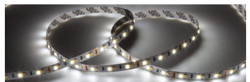
Index: R-2835-600-20-BIK-02 PREMIUM BICOLOR LED strip type 2835, IP20, 120 LED/m, 8-mm width, 6 pts/5 cm, 5-metre roll, power of 10W/m, 1100 lm/m EAN code: 5900652141531