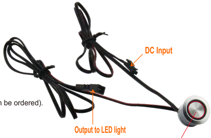
Touch sensor switch / dimmer