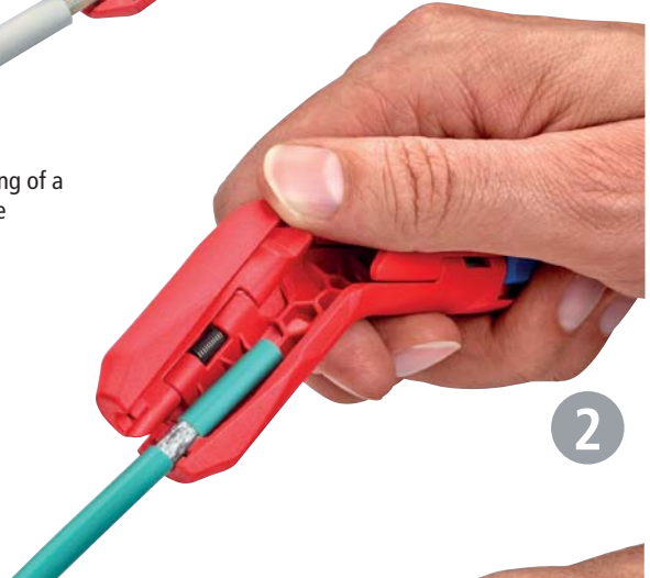
Dismantling of a data cable